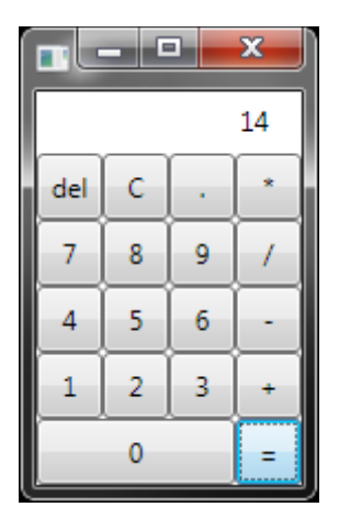
Figure 4. A complete interface. The original test still passes.

Once the evaluation of the proposed process has been performed, the authors hope to explore mixed-fidelity UITDD. Mixed-fidelity prototypes combine hand-drawn elements from low-fidelity prototypes with actual widgets. Our plan is to create a bridge between these widgets in the prototype and actual features of the application being developed. By incrementally replacing sections of the lowfidelity prototype with functional widgets, a GUI can be incrementally developed from its prototype. This approach could avoid the gap between recording tests on a low-fidelity prototype and running them on a separate GUI.