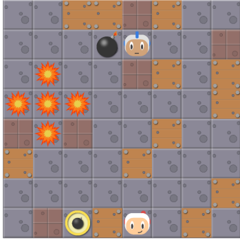
Figure 2: A still of the Pommerman game. The game is played in an 8 by 8 tile grid. Players can take one of six actions in each timestep: Up, Down, Left, Right, Pass, and Place a bomb.